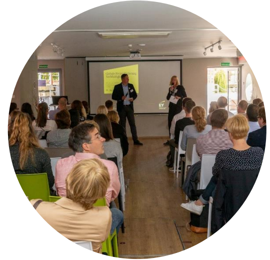
Workshops & Expert Days